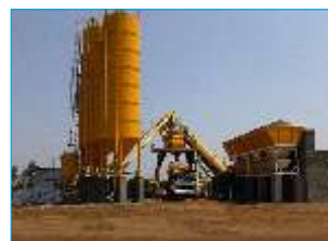
Concrete Batching Plant