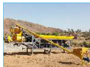
Mobile Batching Plant