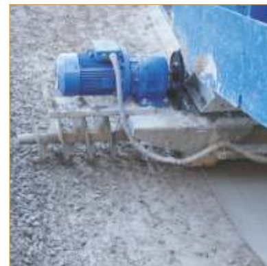
Extra Long Paving (Hardened Auger)