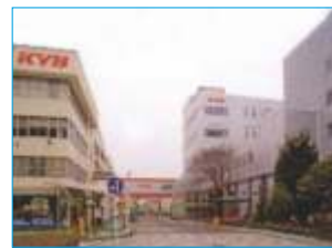
Sagami - Japan