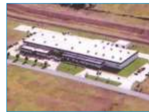
TSW Products - USA