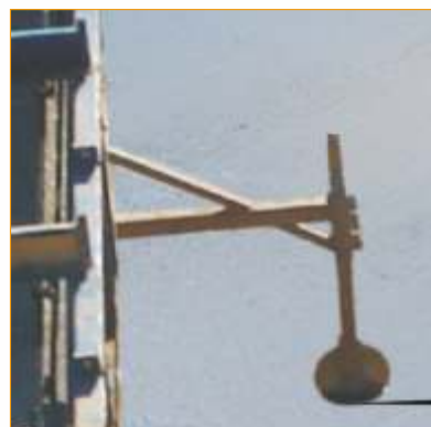
Groove Cutter (Optional)