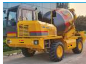
Self Loading Mixer