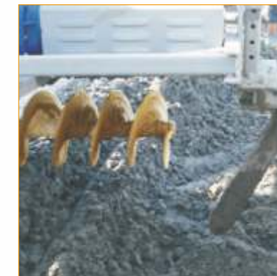
Needle Vibrator (Optional)