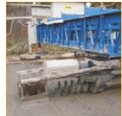
PAN Vibrator (Optional)

KYB-Conmat manufactures exclusive range of standard and customized high performance Paving Machines for slopes well as horizontal surfaces. These world class products are characterized by high efficiency, reliability, as well as solidity. Our dedicated team of engineers ensure excellent support right from installation to commissioning and after sales service.