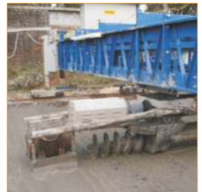
PAN Vibrator (Optional)

Paves Half Width, Trapezoidal Canals, & Straight side slopes up to 45 degree angle. • Rated output 18-20 cu.mtr./hr under ideal conditions and application • Inbuilt vibratory cylinder attachment for better compaction • Optimum use of power for improved overall efficiency of the machine.