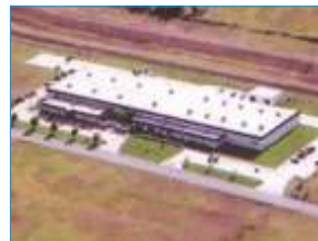
TSW Products - USA