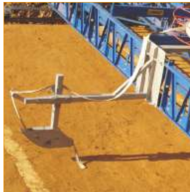
PVC Water Stop Attach (Optional)