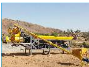
Mobile Batching Plant