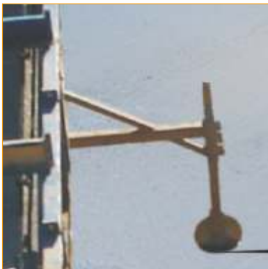
Groove Cutter (Optional)