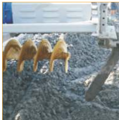
Needle Vibrator (Optional)