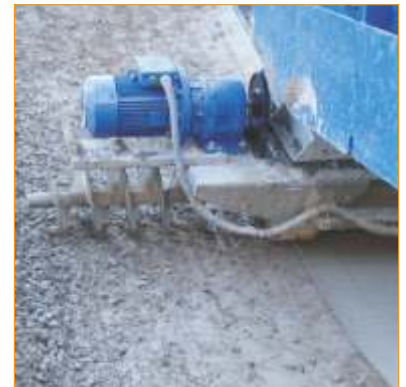
Extra Long Paving (Hardened Auger)

KYB-Conmat manufactures exclusive range of standard and customized high performance Paving Machines for slopes well as horizontal surfaces. These world class products are characterized by high efficiency, reliability, as well as solidity. Our dedicated team of engineers ensure excellent support right from installation to commissioning and after sales service.