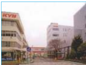
Sagami - Japan