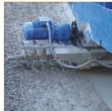
Extra Long Paving (Hardened Auger)