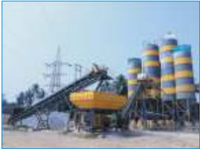
Deep Bucket Batching Plant