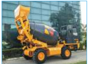
Self Loading Mixer