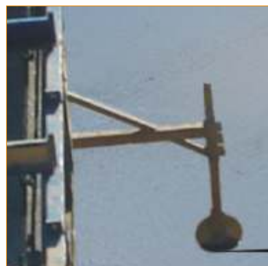
Groove Cutter (Optional)