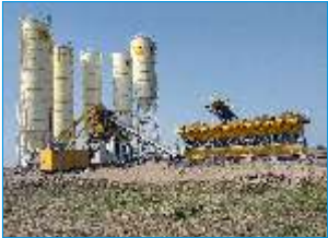
Concrete Batching Plant (INFRA Series)