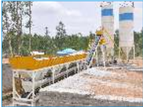
Concrete Batching Plant (RMC Series)