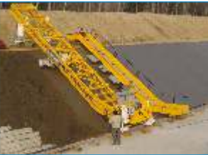
Concrete Canal Paver