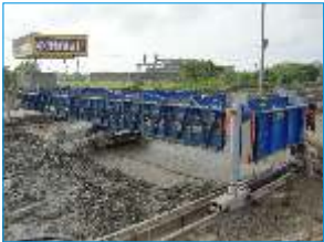
Concrete Road Paver