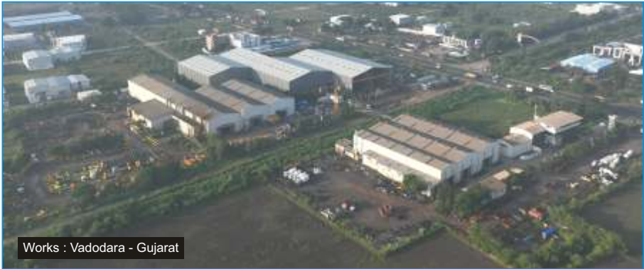
Works : Vadodara - Gujarat