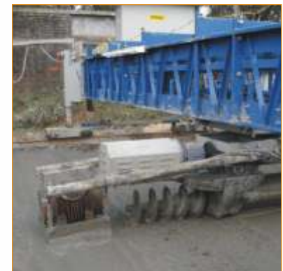
PAN Vibrator (Optional)

Conmat manufactures exclusive range of standard and customized high performance Paving Machines for slopes well as horizontal surfaces. These world class products are characterized by high efficiency, reliability, as well as solidity. Our dedicated team of engineers ensure excellent support right from installation to commissioning and after sales service.