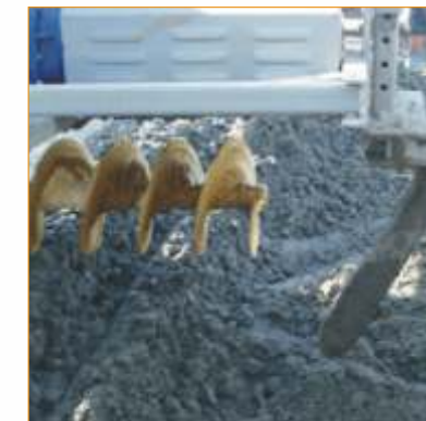
Needle Vibrator (Optional)