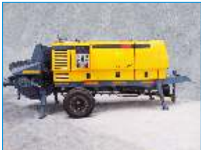
Stationary Concrete Pump