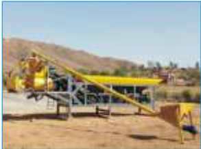
Mobile Batching Plant