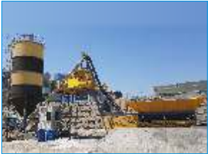
Tora Batching Plant