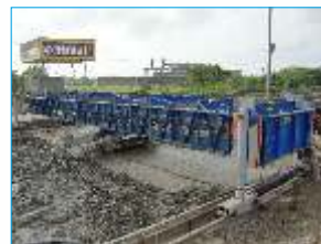
Concrete Road Paver