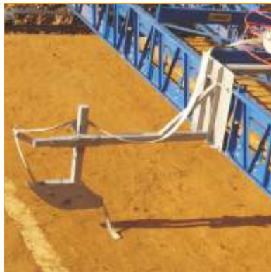
PVC Water Stop Attach (Optional)