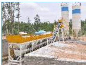
Concrete Batching Plant (RMC Series)