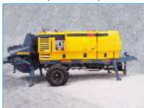
Stationary Concrete Pump