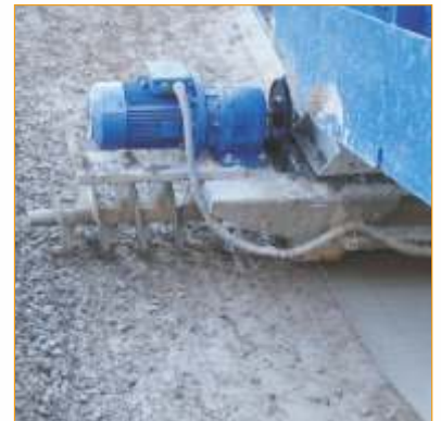
Extra Long Paving (Hardened Auger)

Conmat manufactures exclusive range of standard and customized high performance Paving Machines for slopes well as horizontal surfaces. These world class products are characterized by high efficiency, reliability, as well as solidity. Our dedicated team of engineers ensure excellent support right from installation to commissioning and after sales service.