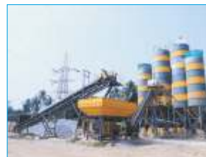
Deep Bucket Batching Plant