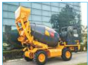
Self Loading Mixer