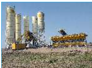
Concrete Batching Plant (INFRA Series)