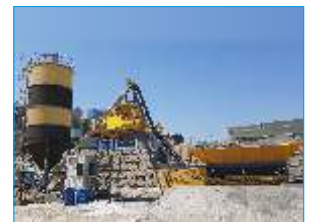
Tora Batching Plant