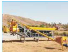
Mobile Batching Plant