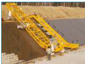
Concrete Canal Paver