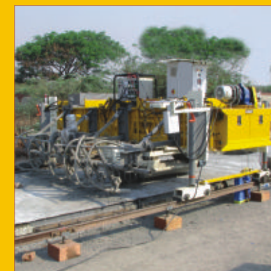
Gang Vibrator (Optional)