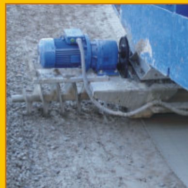
Extra Long Paving (Hardened Auger)

Conmat manufactures exclusive range of standard and customized high performance Paving Machines for slope as well as horizontal surfaces. These world class products are characterized by high efficiency, reliability, as well as solidity. Our dedicated team of engineers ensure excellent support right from installation to commissioning and after sales service.