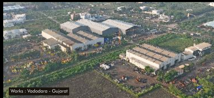
Works : Vadodara - Gujarat

CONMAT HEAVY INDUSTRIES PVT. LTD. Formerly Known as KYB Conmat Pvt. Ltd.