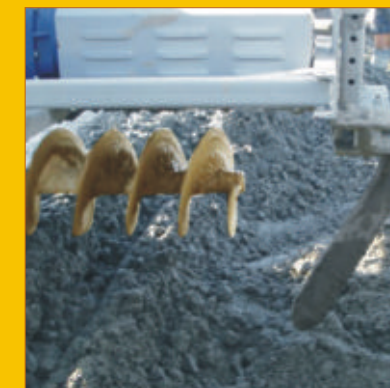
Needle Vibrator (Optional)