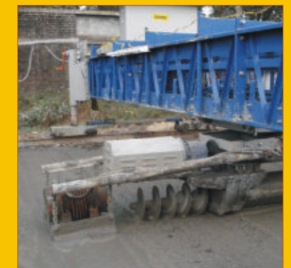
PAN Vibrator (Optional)