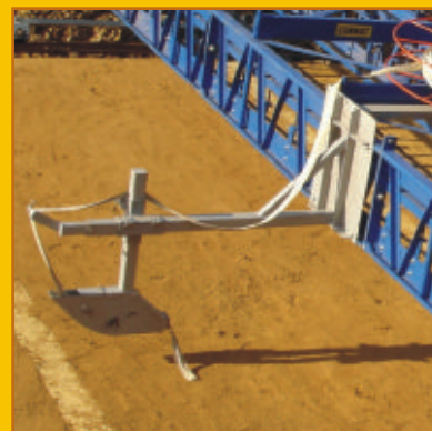
PVC Water Stop Attach (Optional)