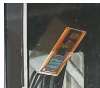
Electronic batch controller