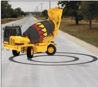
Short turning radius