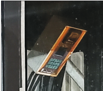
Electronic batch controller