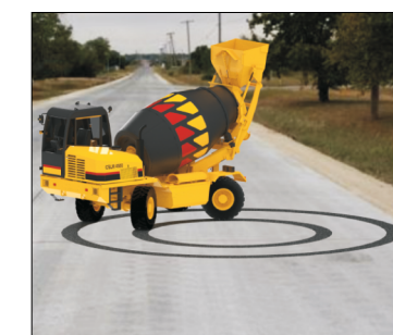
Short turning radius