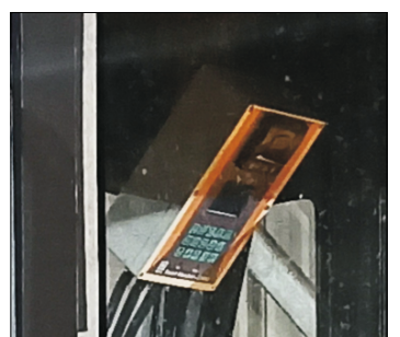
Electronic batch controller