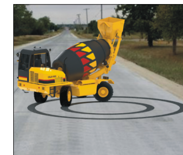
Short turning radius