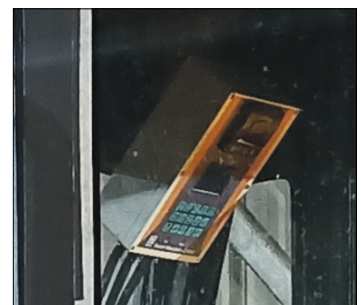
Electronic batch controller