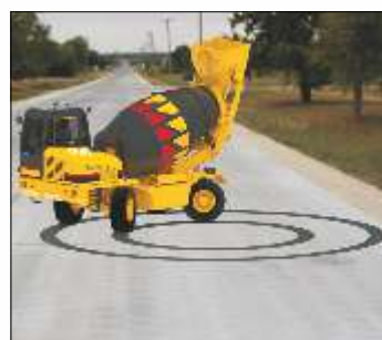
Short turning radius