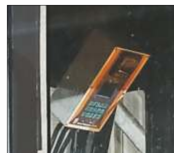
Electronic batch controller