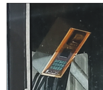
Electronic batch controller